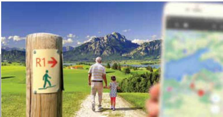
With TECNIS Eyhance ® Toric II IOLs

These images are for illustrative purposes only and do not represent actual data derived from studies. These illustrative simulations are intended to help you better understand your vision in certain eye conditions.