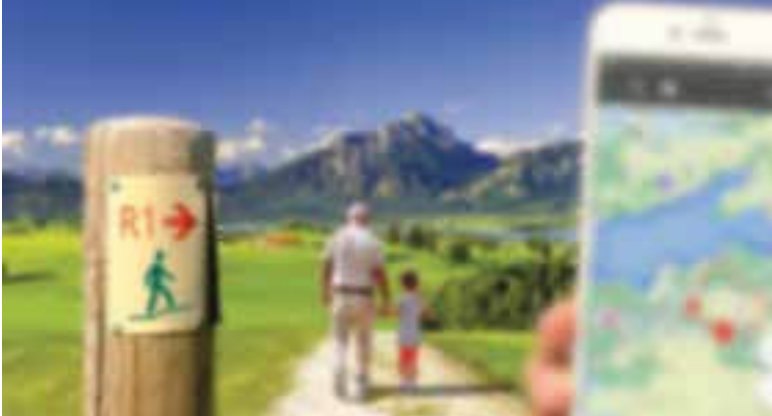
With presbyopia and astigmatism

Other solutions include prescription glasses and contacts made for astigmatism or an additional surgery