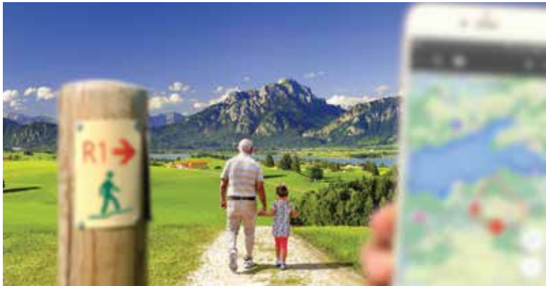
With traditional monofocals